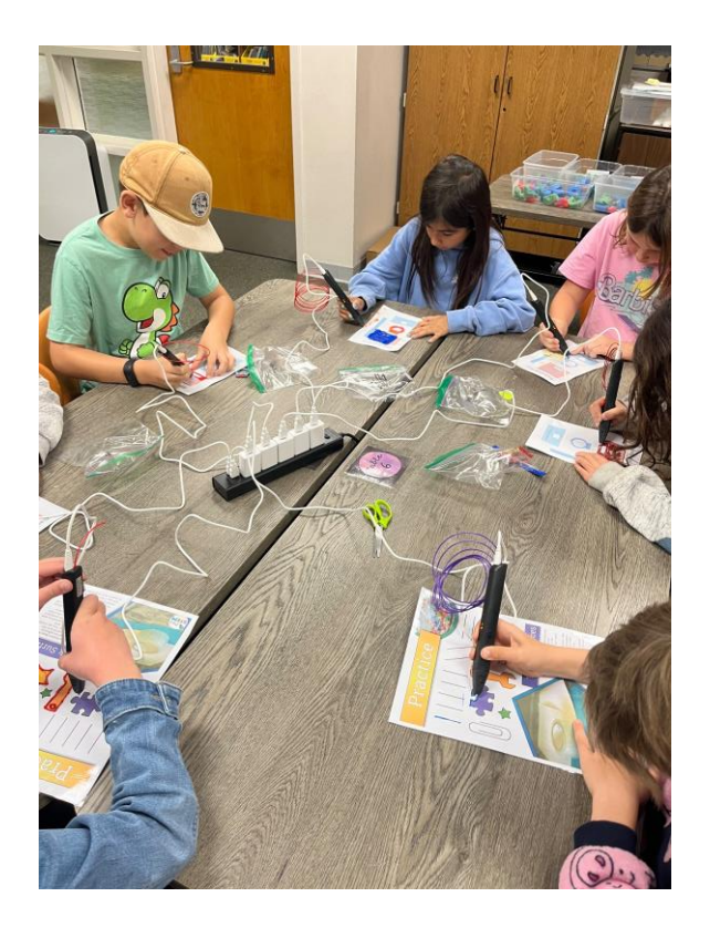
Pictured are McGaugh students using 3D pens purchased with LAEF grant funds.