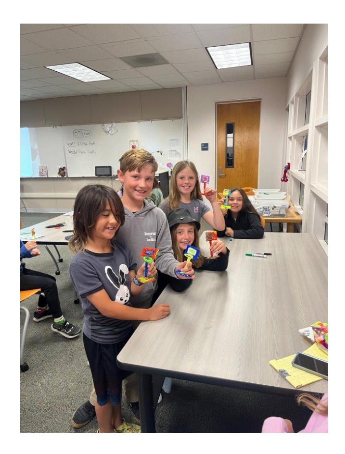
Pictured are McGaugh students showing off basketball hoops created using 3D pens purchased with LAEF grant funds.

LAEF is the non-profit partner of Los Alamitos Unified School District. LAEF enhances educational excellence by providing after-school and summer enrichment programs to children in grades Pre-K to 12. LAEF impacts all students by providing significant funding for student mental health/wellness and STEAM instruction, as well as igniting new programs and providing valuable resources. For more information, visit www.LAEF4kids.org or call (562) 799-4700 Extension 80424 today.