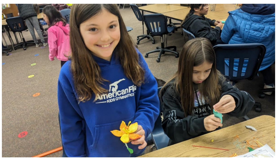
Pictured are LAE students showing off their flowers created using 3D pens purchased with LAEF grant funds.