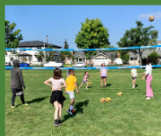
SEI kids enjoying Art (left) and Volleyball (right) this summer at Rossmoor Elementary.