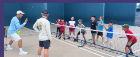
McGaugh Elementary kids learning Pickleball during the After-School Program.

LAEF Has Donated Over $2.64 Million to Los Al Kids Since 2013!