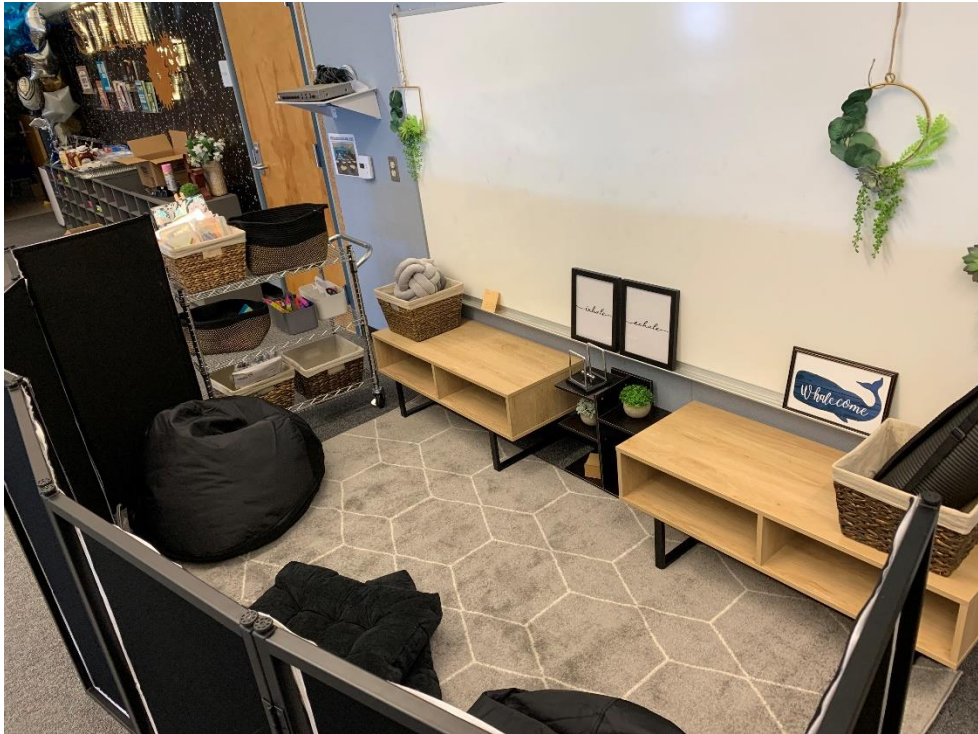
Weaver's Peaceful Pod, dreamed up by students in the Ambassadors program and funded by LAEF.