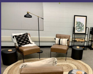
The Corner at McAuliffe