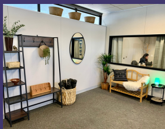
The Den at Oak