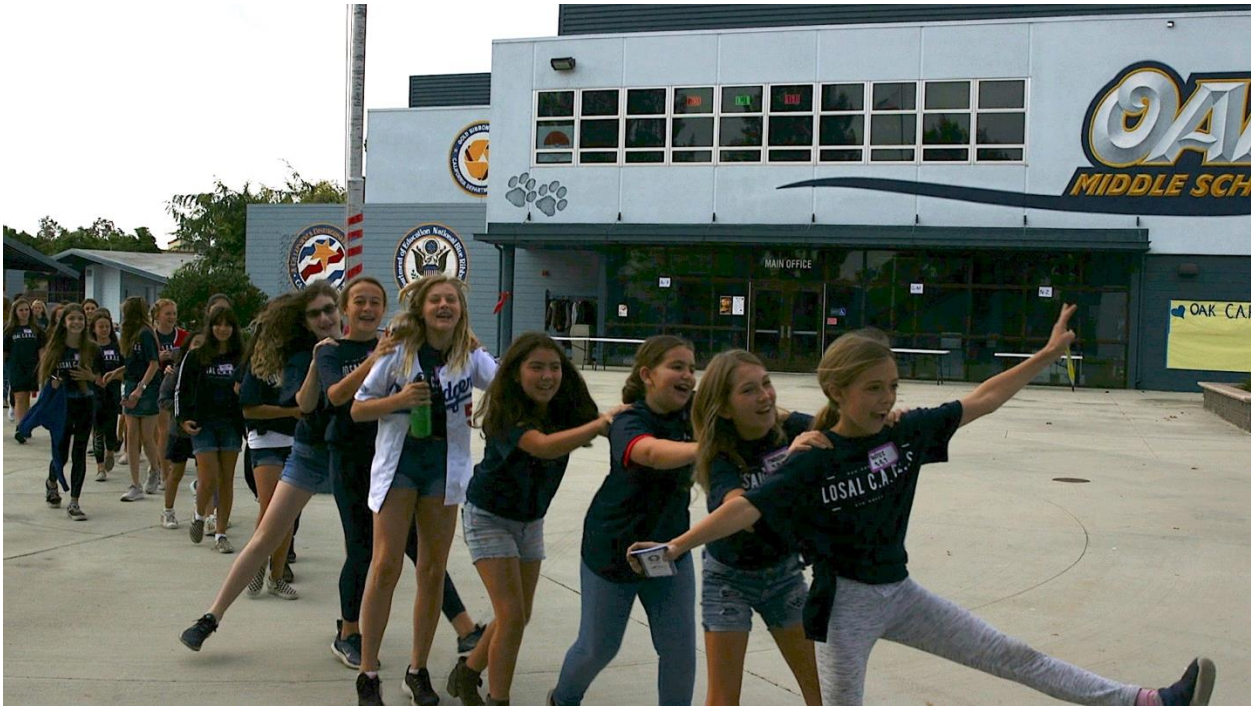
Enthusiastic Oak Middle School sixth-graders students arrive for summit assembly.