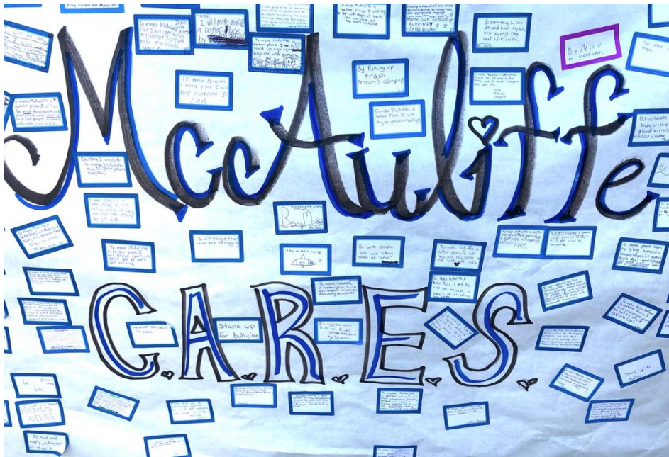
McAuliffe students contribute human relations commitments to school wall.