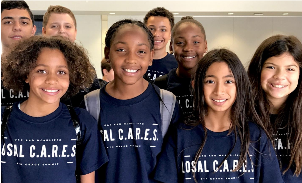
The sixth-grade summit left these Oak students smiling.